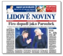
Lidové noviny Mon, 14 Jun 2010 14 hour(s) 56 minutes ago