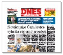
MF DNES Mon, 14 Jun 2010 12 hour(s) 53 minutes ago