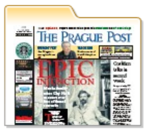
The Prague Post Wed, 9 Jun 2010 5 day(s) 16 hour(s) ago