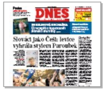
Dnes Prague Edition Mon, 14 Jun 2010 2 hour(s) 38 minutes ago