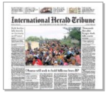
International Herald Tribune Mon, 14 Jun 2010 15 hour(s) 41 minutes ago