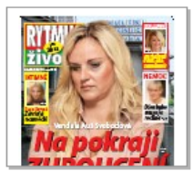
Rytmus Zivota Mon, 7 Jun 2010 6 day(s) 21 hour(s) ago